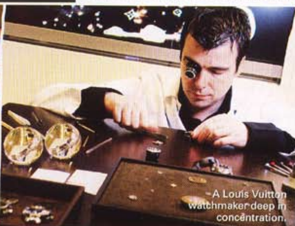
A Louis Vuitton watchmaker deep in concentration.