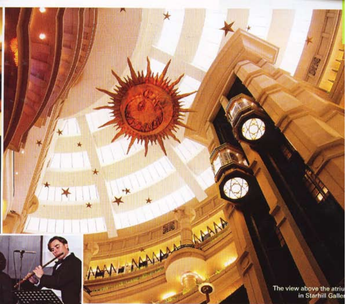
The view above the atrium in Starhill Gallery